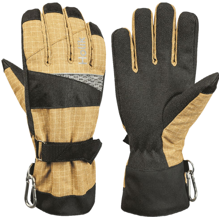
Angel 8003 Beige